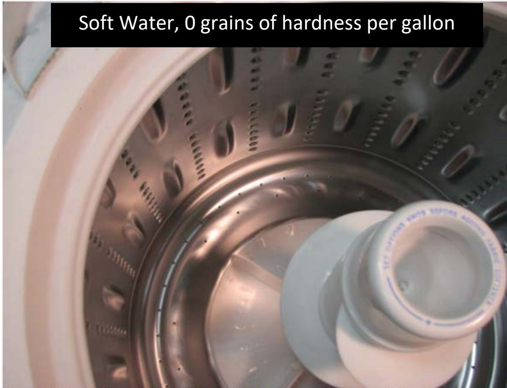
Figure 5-26. Drum of the laundry washer using softened water was almost completely free from water scale buildup.

Soft Water, 0 grains of hardness per gallon